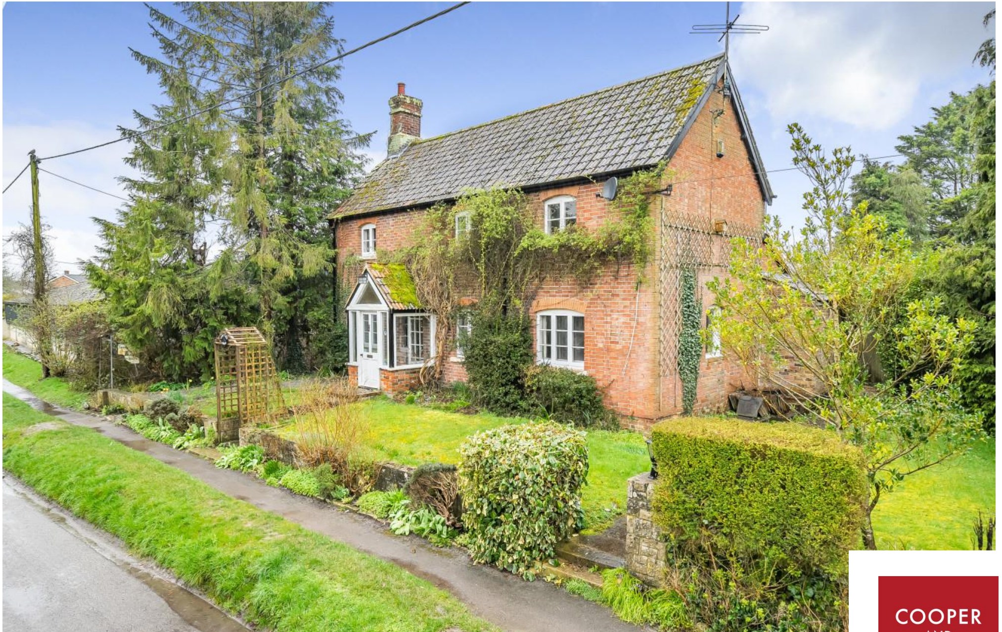
Cross Key House, The Street, All Cannings, Devizes, Wiltshire, SN10 3NY