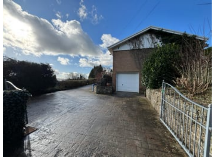
A gated block Pavia style concreted drive leading up to a generous parking area.