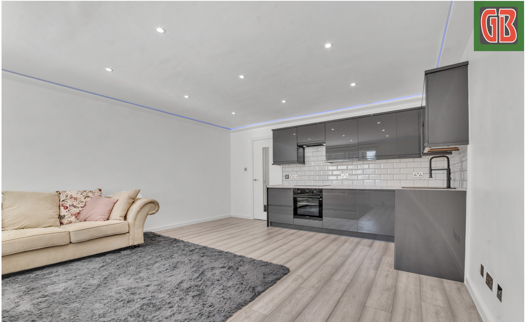
208 Fleetwood Court, Douglas Road, Staines-upon-Thames, Surrey. TW19 7JN. 0 Bedroom Apartment - £157,500 Leasehold