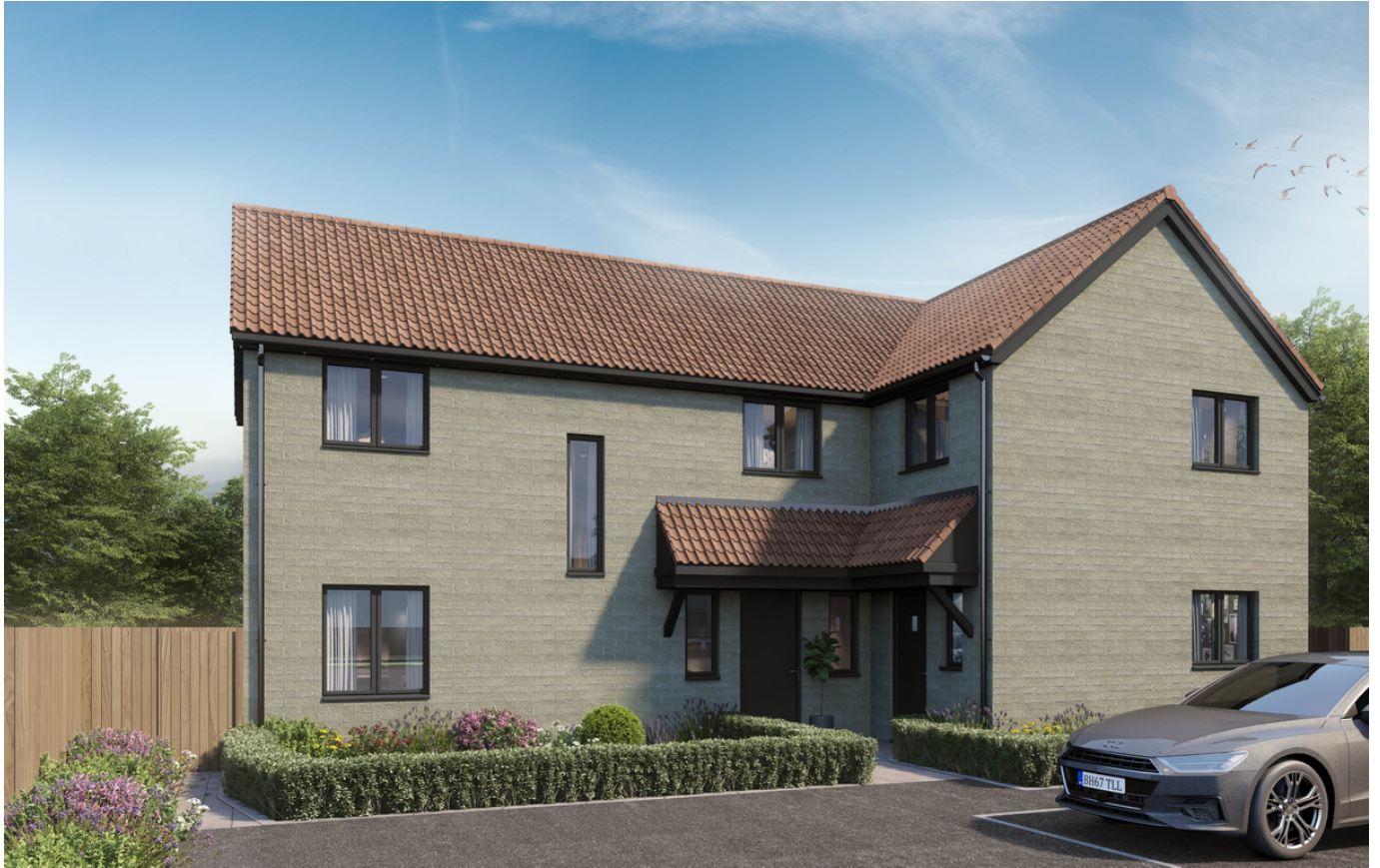
Plot 1 2 Bedroom Home