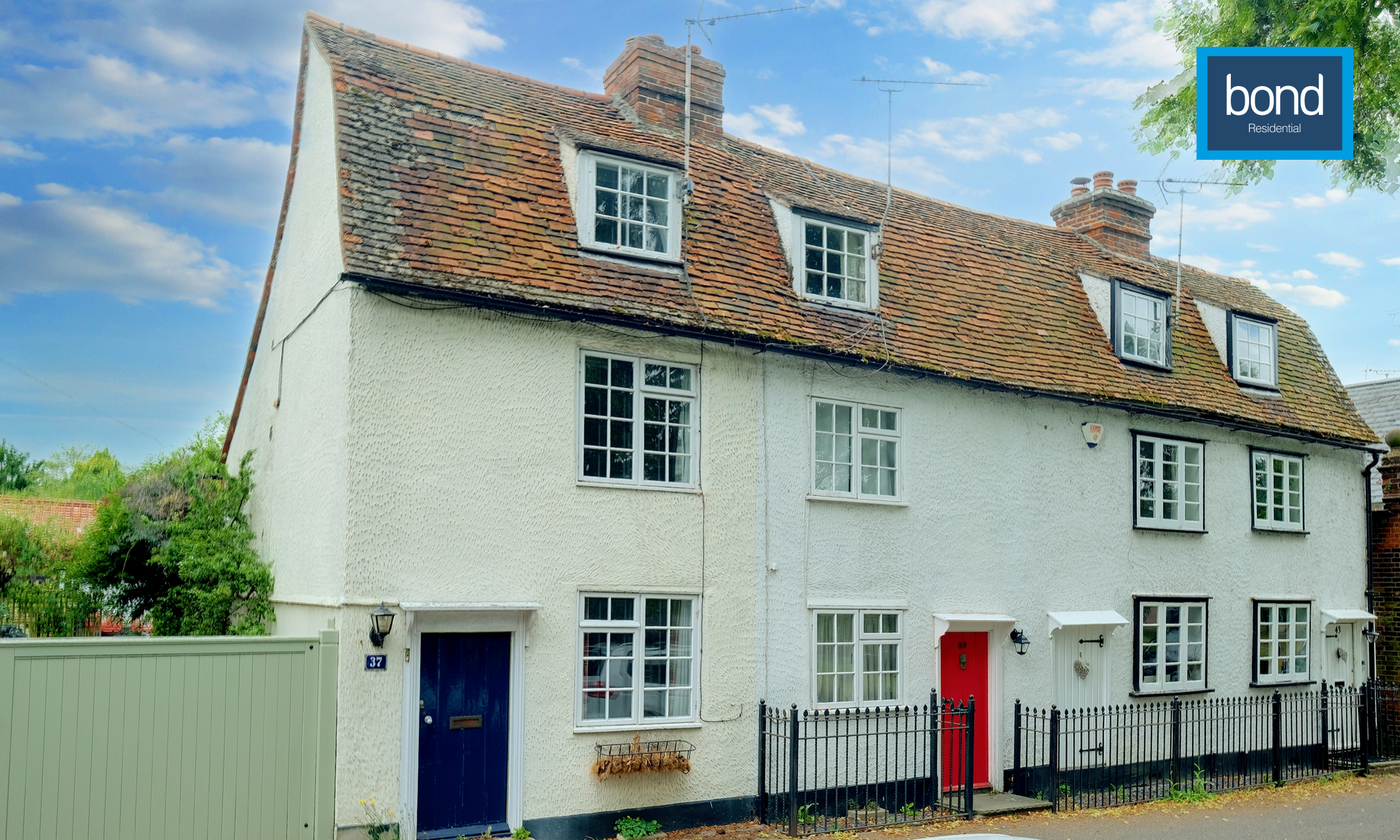
The Green, Writtle, Chelmsford, Essex, CM1 3DT