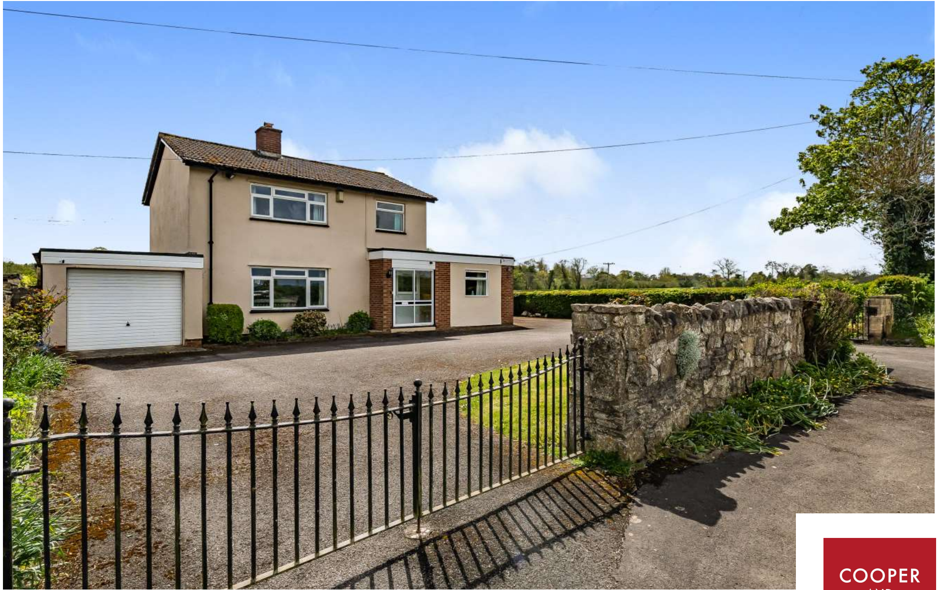
The Old Police House, Mells, BA11 3PS