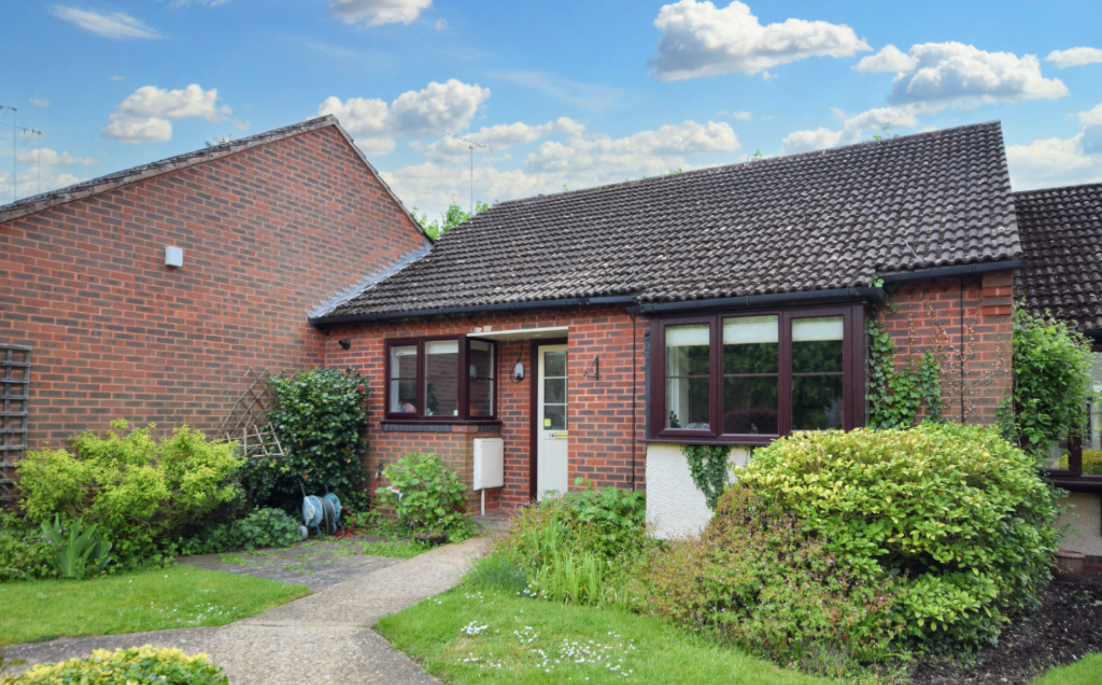
16 Stratford Court Avon Road, Farnham. GU9 8PG. Guide Price £350,000