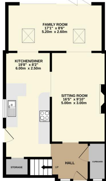
GROUND FLOOR 548 sq.ft. (50.9 sq.m.) approx.

TOTAL FLOOR AREA : 948 sq.ft. (88.0 sq.m.) approx. Whilst every attempt has been made to ensure the accuracy of the floorplan contained here, measurements of doors, windows, rooms and any other items are approximate and no responsibility is taken for any error, omission or mis-statement. This plan is for illustrative purposes only and should be used as such by any prospective purchaser. The services, systems and appliances shown have not been tested and no guarantee as to their operability or efficiency can be given. Made with Metropix ©2024