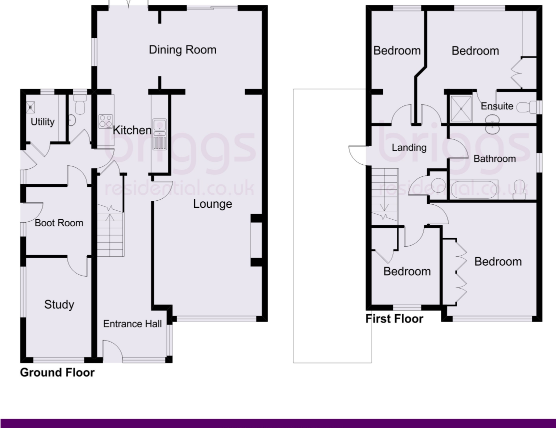
These particulars do not constitute part or all of an offer or contract. The measurements and details are supplied for guidance only and as such must be considered incorrect. Potential buyers are advised to recheck the measurements before committing to any expense. Briggs Residential have not tested any apparatus, equipment, services, fixtures or fittings and it is in the buyers interest to check the working condition of appliances. Briggs Residential have not sought to verify the legal title or structure of the property and suggest buyers obtain such verification from their solicitors.