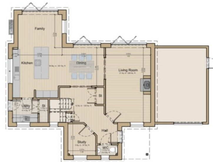
GROUND FLOOR PLAN GIA FLOOR AREA - 88 Sq. m - 952 Sq. ft