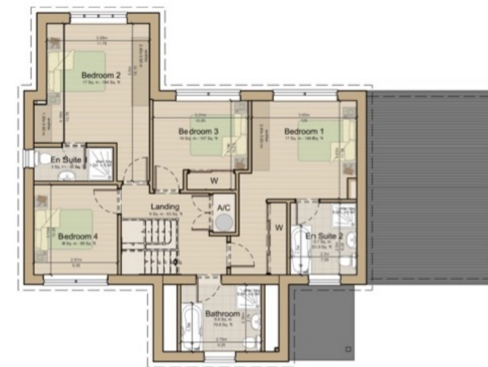
FIRST FLOOR PLAN GIA FLOOR AREA - 85 Sq. m - 916 Sq. ft