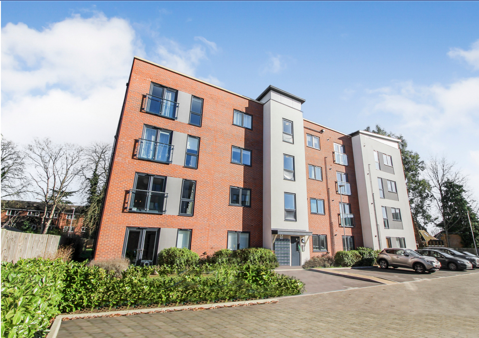
Elvian Close, Reading, Berkshire.