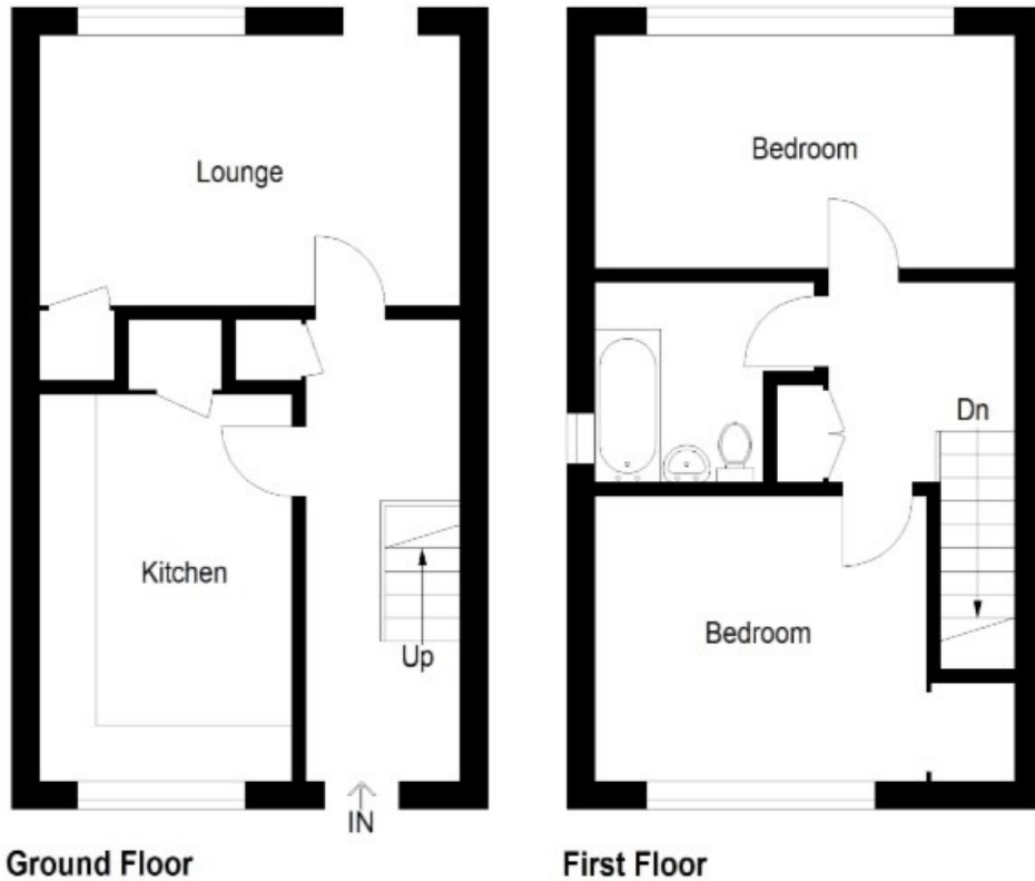
Illustration For Identification Purposes Only. Not To Scale (ID:1128559 / Ref:89327)

Approximate Gross Internal Area 72.0 sq m / 775 sq ft