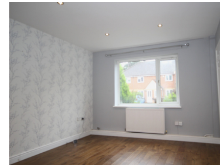
1 Martin Way, Letchworth Garden City, Hertfordshire, SG6 4XU