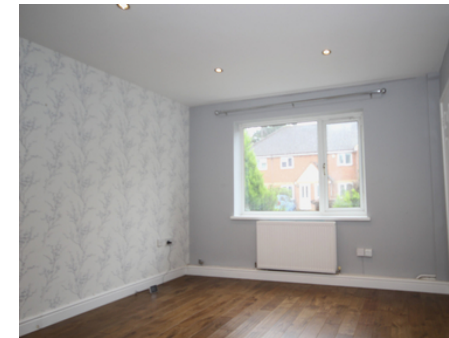
1 Martin Way, Letchworth Garden City, Hertfordshire, SG6 4XU