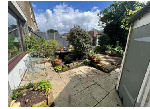
Selby Court, Huntingdon PE29 1HP