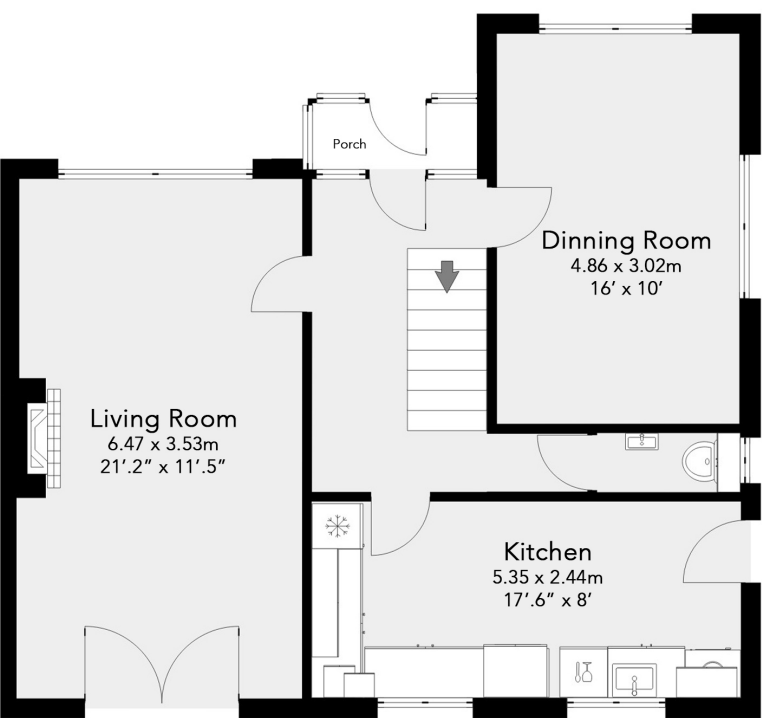
Ground Floor approx 62.5 sqm 673 sqft