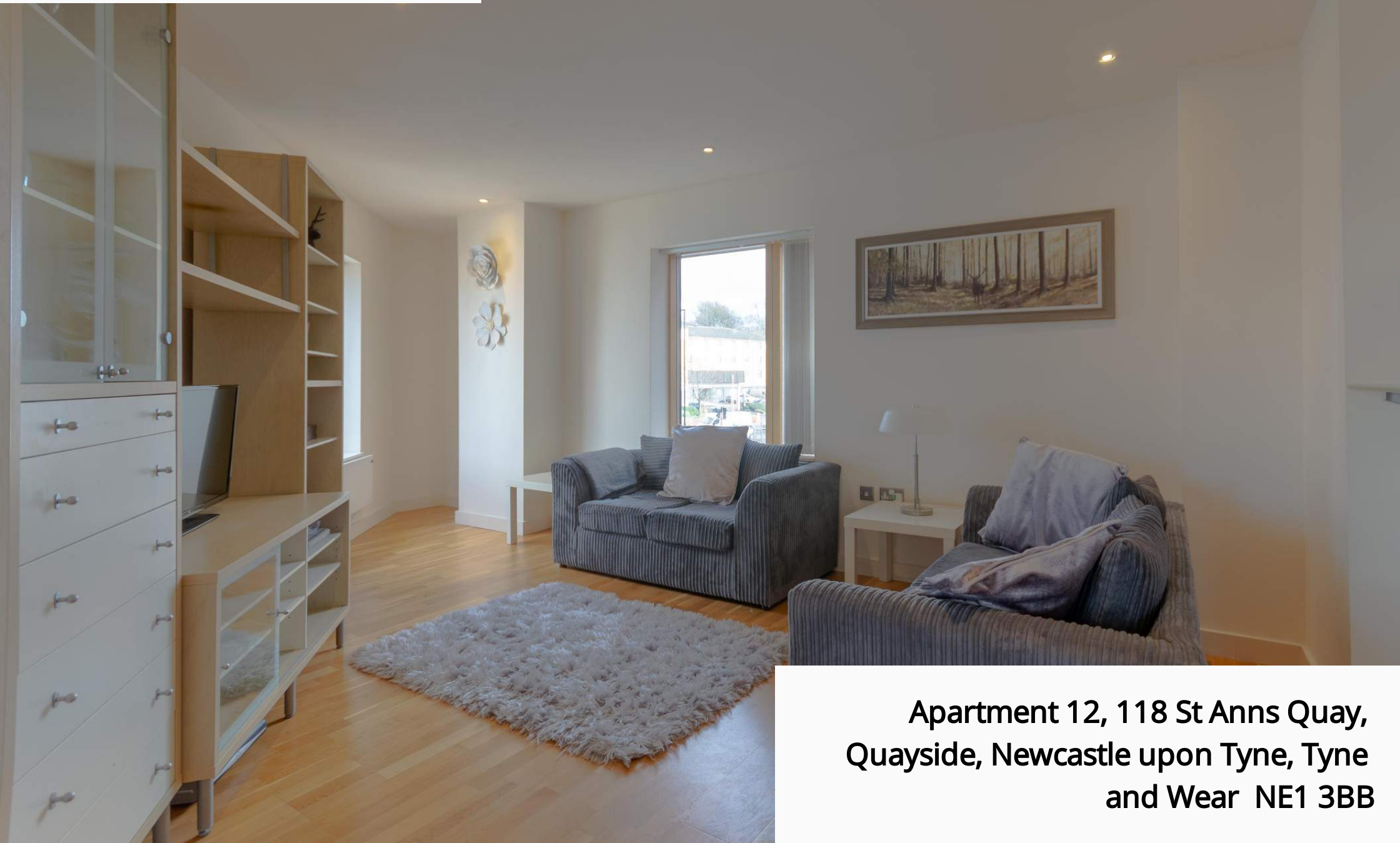
Apartment 12, 118 St Anns Quay, Quayside, Newcastle upon Tyne, Tyne and Wear NE1 3BB