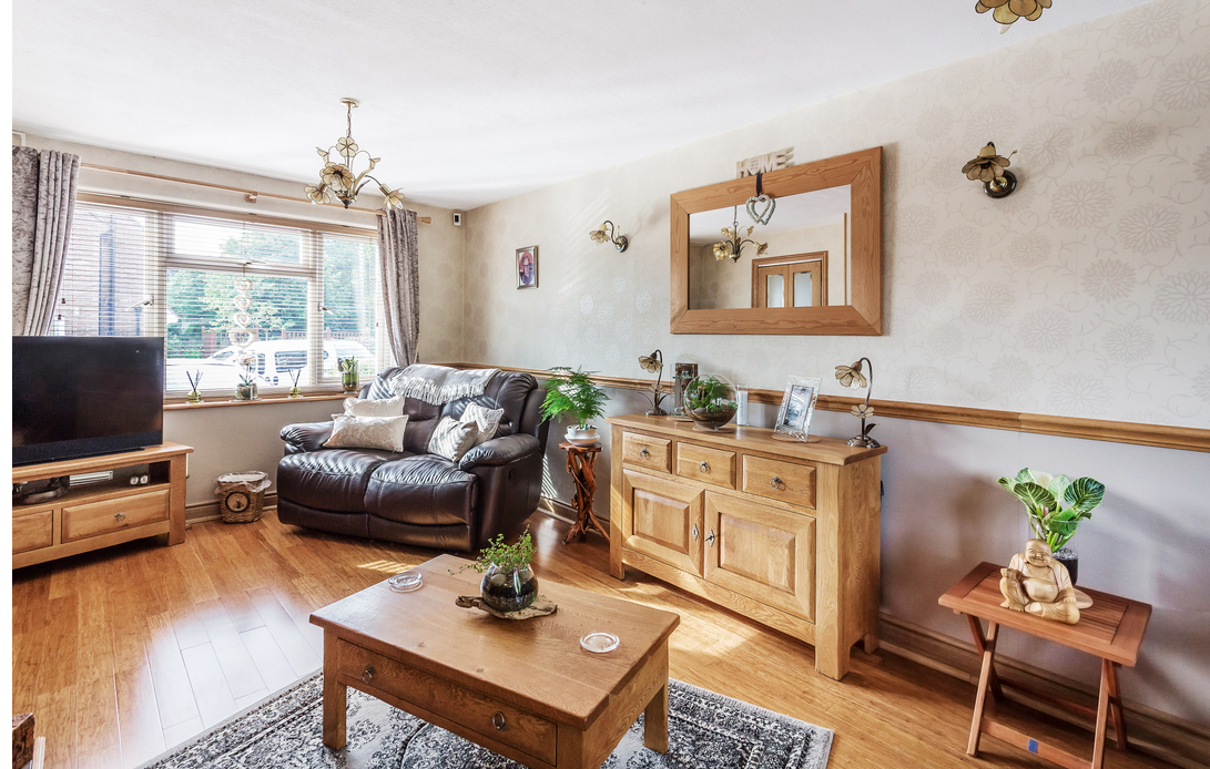
7 Hillcrest, Four Elms, Edenbridge, Kent TN8 6NH £400,000 - Freehold