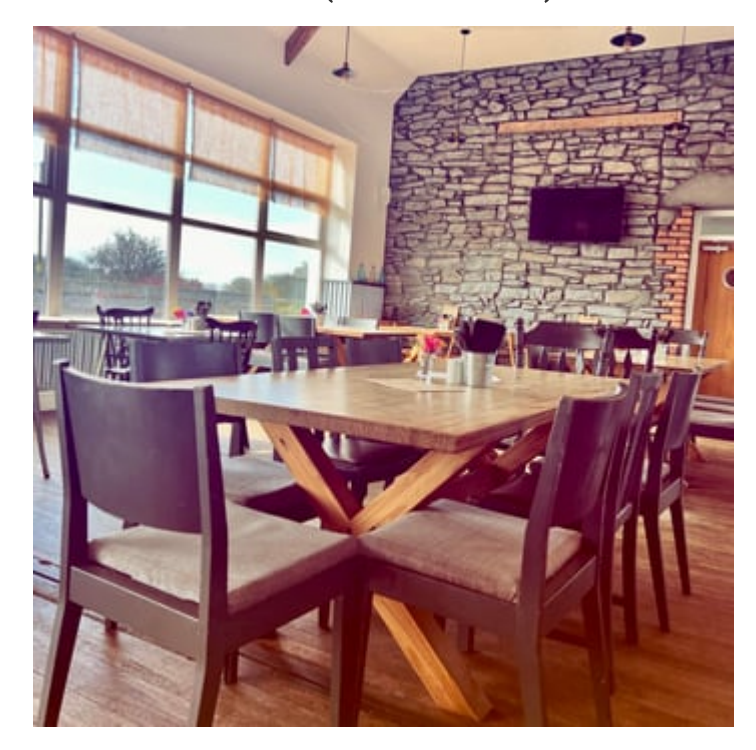
RESTAURANT/BAR (FOURTH IMAGE)