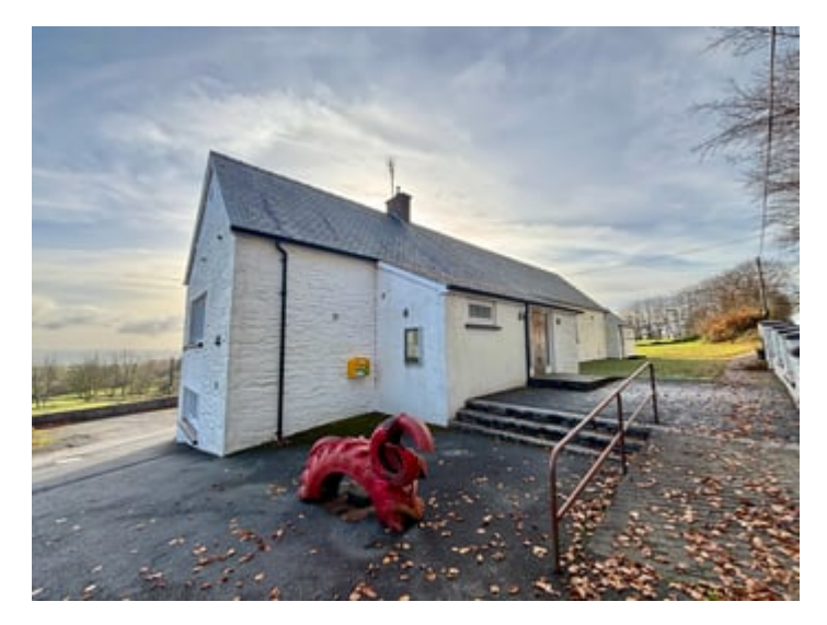
FRONT OF PROPERTY (SECOND IMAGE)