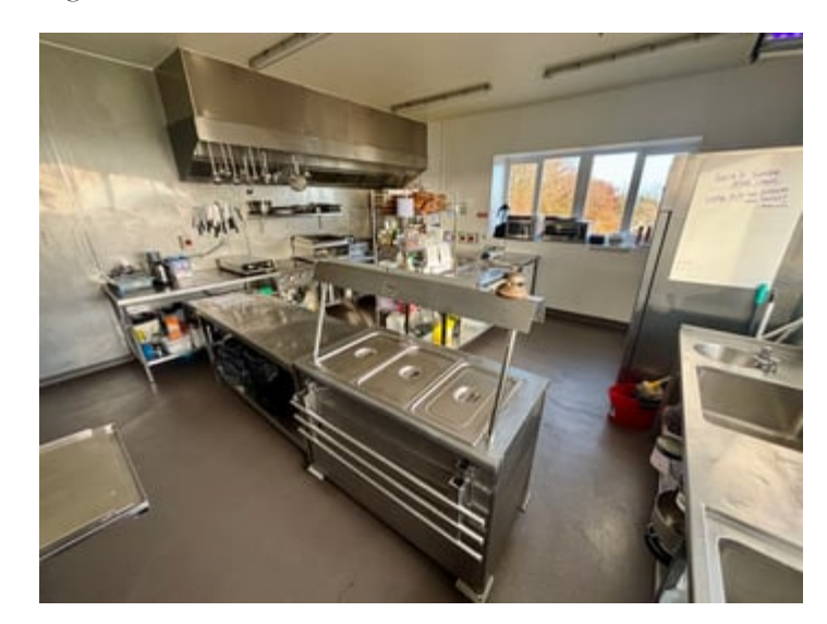
KITCHEN (SECOND IMAGE)

19' 6" x 17' 6" (5.94m x 5.33m). A fully functional stainless steel catering kitchen with two fitted sink units, large catering extractor fans. All catering equipment inventory available by negotiation.