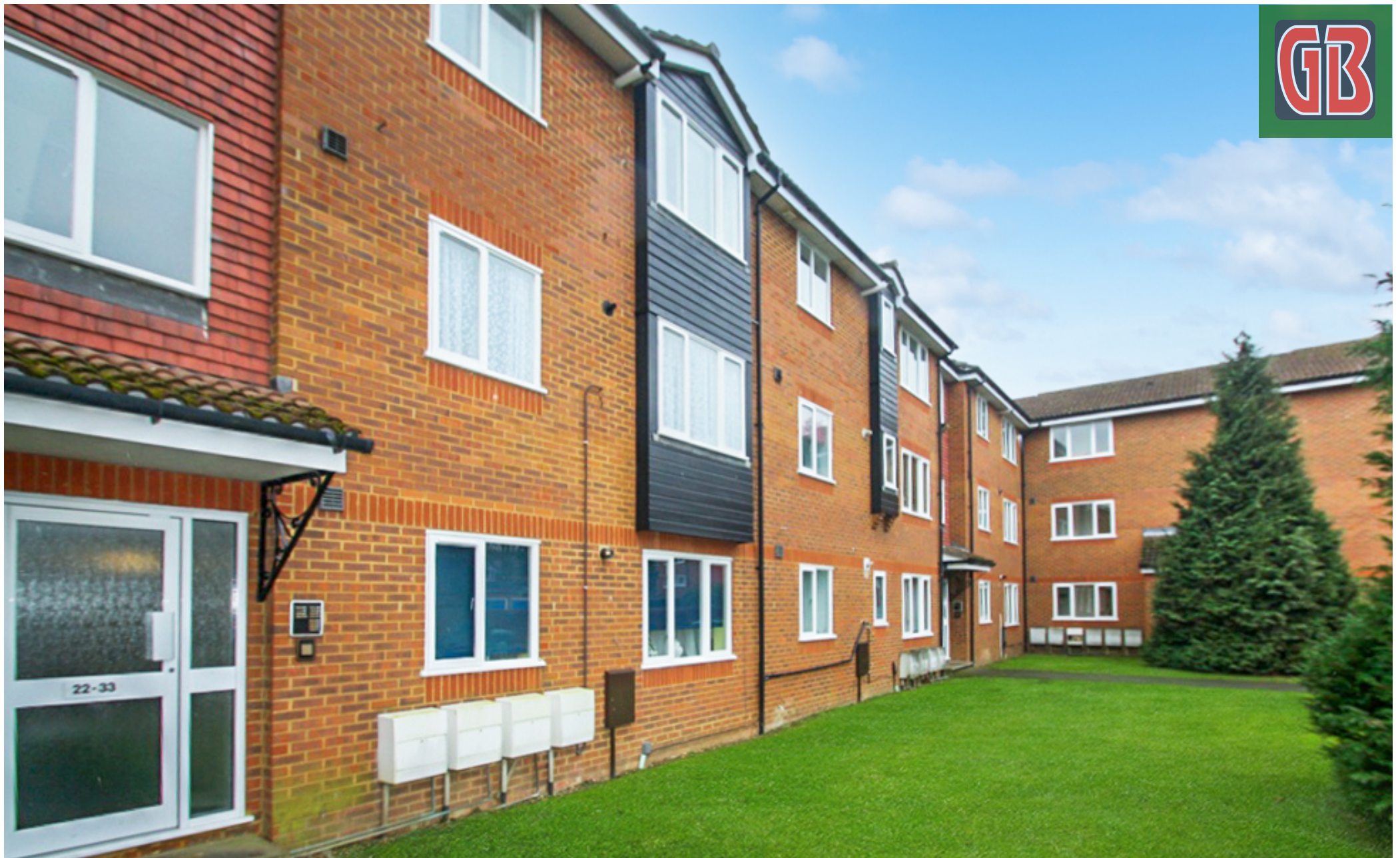
26 Maynard Court Rosefield Road, Staines-upon-Thames. TW18 4QD. 1 Bedroom Apartment - £200,000 Leasehold