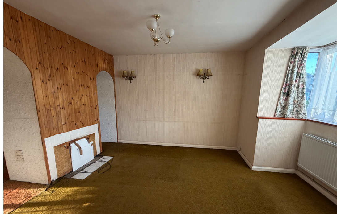
28 Brookside Avenue, Ashford, Surrey TW15 3LX Offers in excess of £450,000 - Freehold