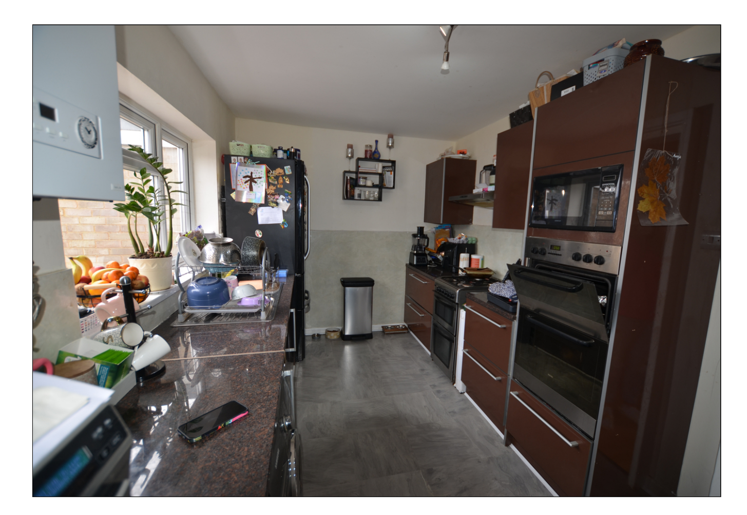
Capitol Lettors has not tested any of the equipment or the heating system (if mentioned) in these details. Purchasers are advised to satisfy themselves as to their working order and condition. These particulars do not constitute or form any part of an offer or contract nor may they be regarded as representations. All interested parties must themselves verify their accuracy. All measurements are approximate.