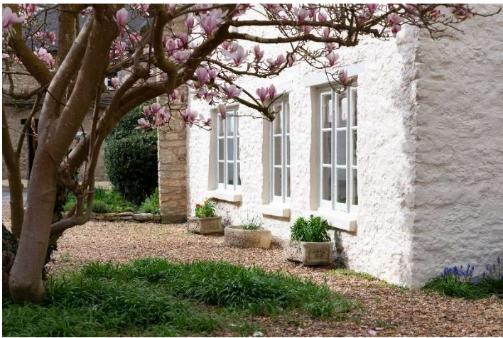
Foxwood Cottage 10 Church Road, Stevington, Bedfordshire, MK43 7QB