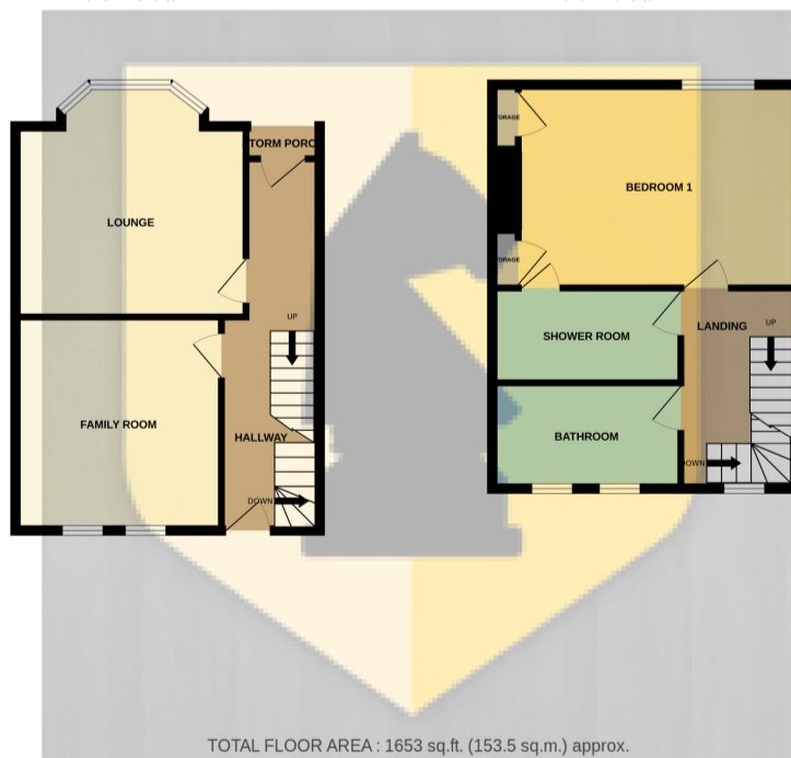
1ST FLOOR 392 sq.ft. (36.5 sq.m.) approx.