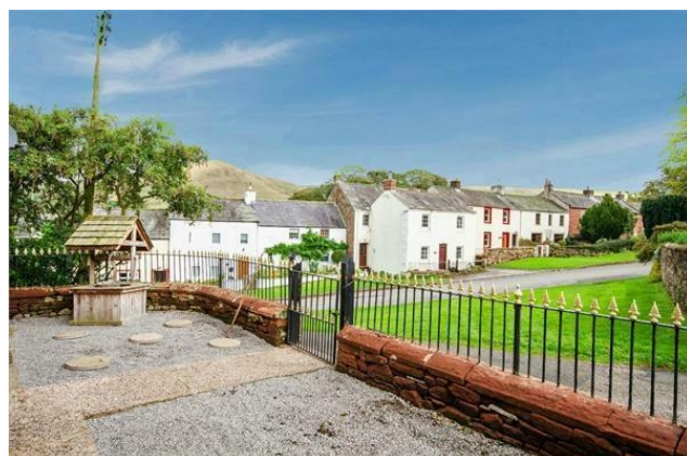
OUTLOOK TO THE FRONT