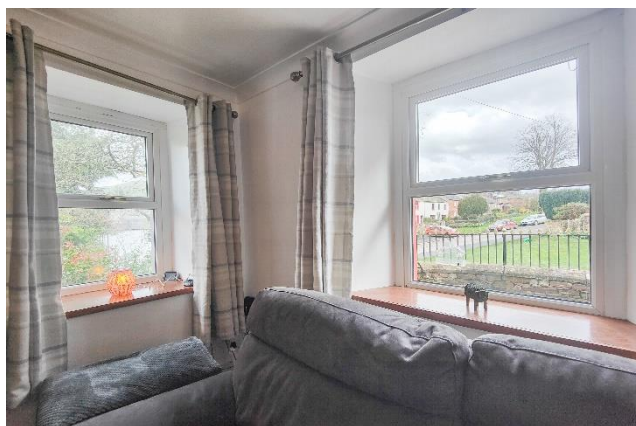
DUAL ASPECT VIEWS

DINING KITCHEN (25' x 12') Kitchen fitted in December 2023 comprising a range of wall and base units, quartz worksurfaces, integrated double sink with Quooker tap, fitted oven and dishwasher. Centre island with hob, wine cooler, storage cupboards. Space for a fridge/freezer, UPVC double glazed windows to the front and side elevations, laminate flooring, wall mounted radiator, spotlights and double glazed composite door to the rear garden.