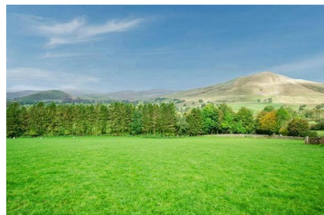
VIEW TO DUFTON PIKE