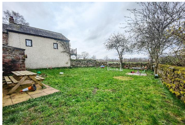
DETACHED BARN AND REAR GARDEN