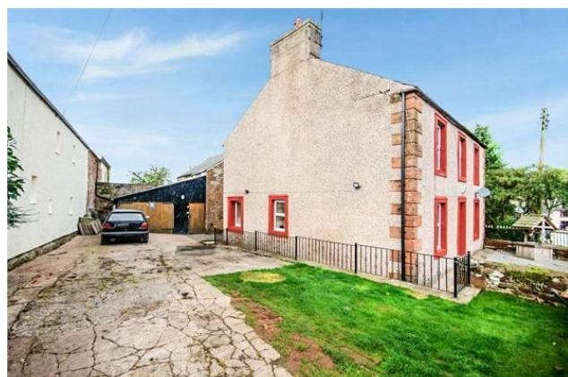
DRIVEWAY AND FRONT GARDEN