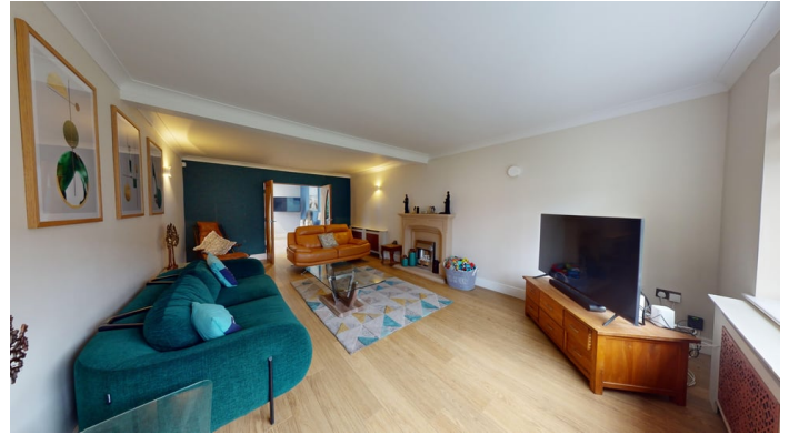
Kitchen and Entertainment Area