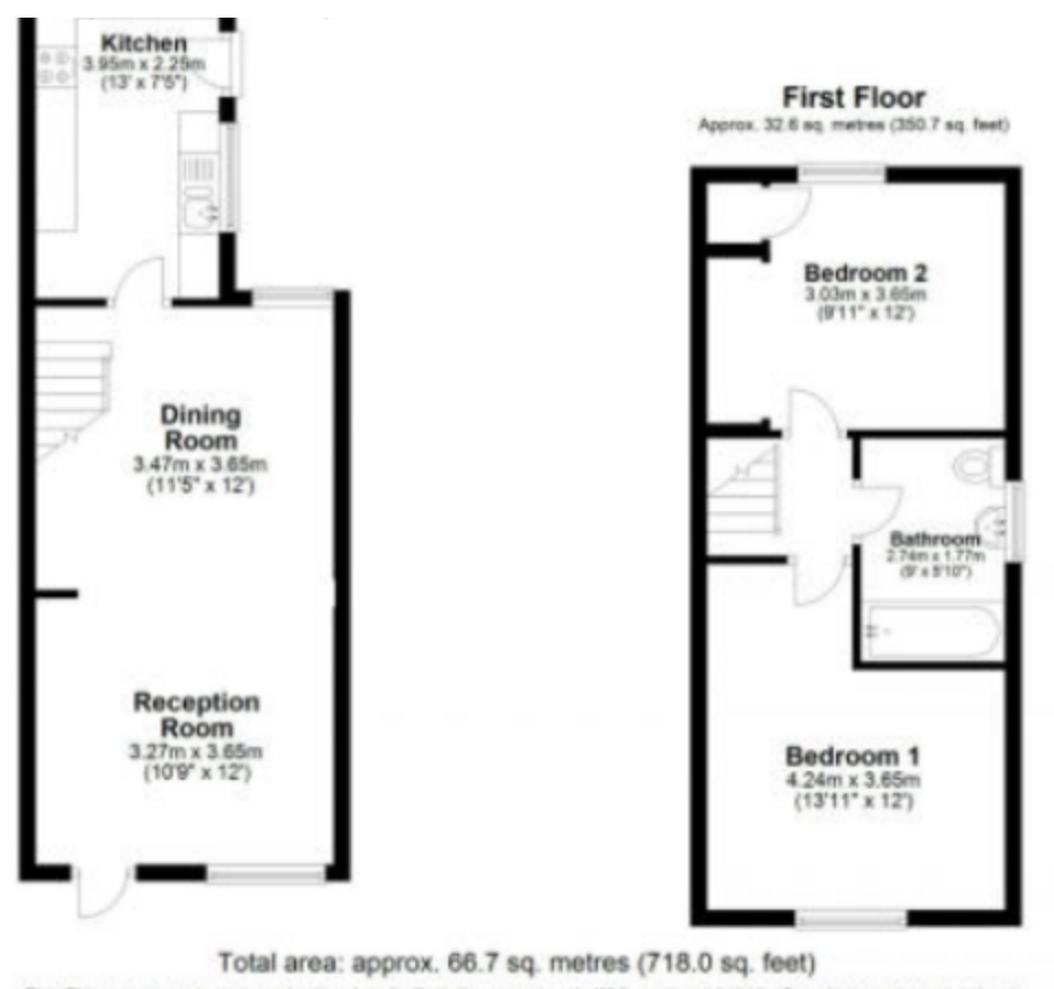
Floor Plan measurements are approximate and are for itualrative purposes only. While we do not doubt the foor plans accuracy, we make no guarantee, warranty or representation as to the accuracy and completeness of the floor plan. Plan produced using PlanUp.