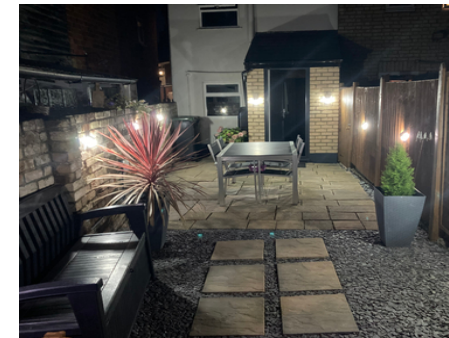
42 Broad Street, Clifton, Shefford, Bedfordshire, SG17 5RJ