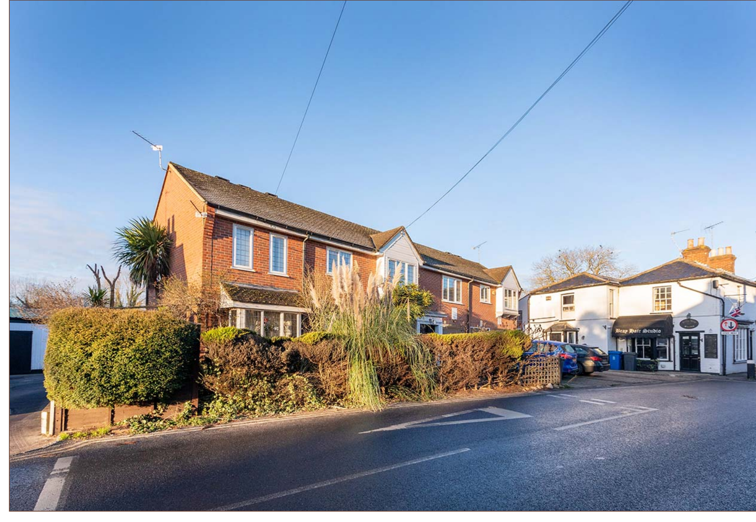
Situated in the heart of the picturesque village of Bray, with its wonderful array of waterside restaurants, this delightful one bedroom ground floor apartment, with garage and parking, is offered for sale with no onward chain.

Gated access leads from the front to the side of the property via a pretty courtyard with mature shrubs and planting. The stable door leads to the Living Room featuring a bay window and parquet flooring throughout. The Kitchen overlooks the front courtyard and is fitted with a range of floor and wall mounted units set to ample work top incorporating a sink unit, oven and hob with extractor above and integrated fridge and freezer.