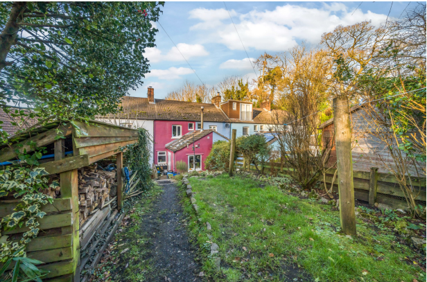
OIEO £250,000 Freehold

A unique opportunity to purchase a charming two-bedroom cottage set in the heart of Lower Vobster, close to Mells and Babington House.