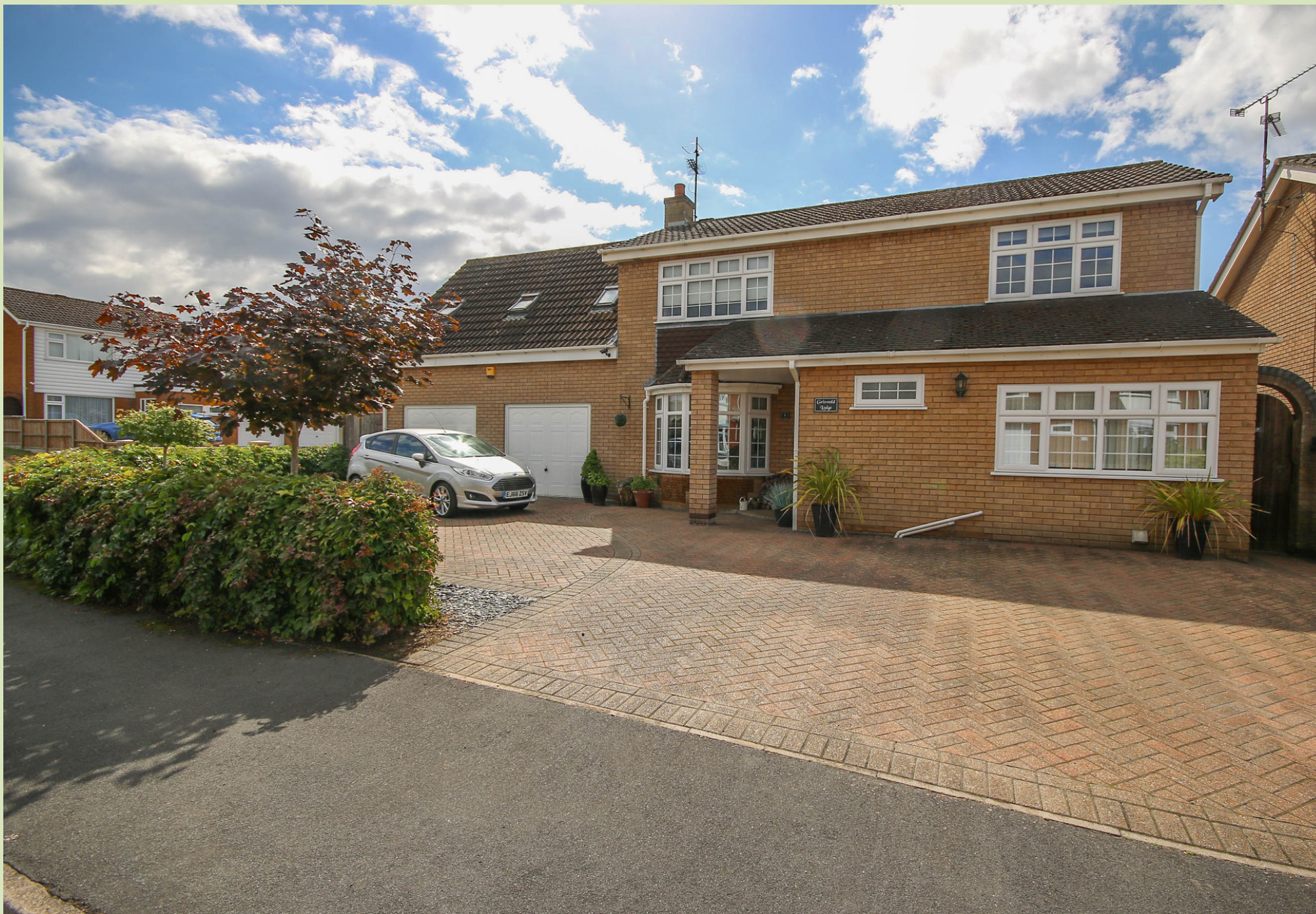
8 Little Walsingham Close, South Wootton Guide Price £450,000