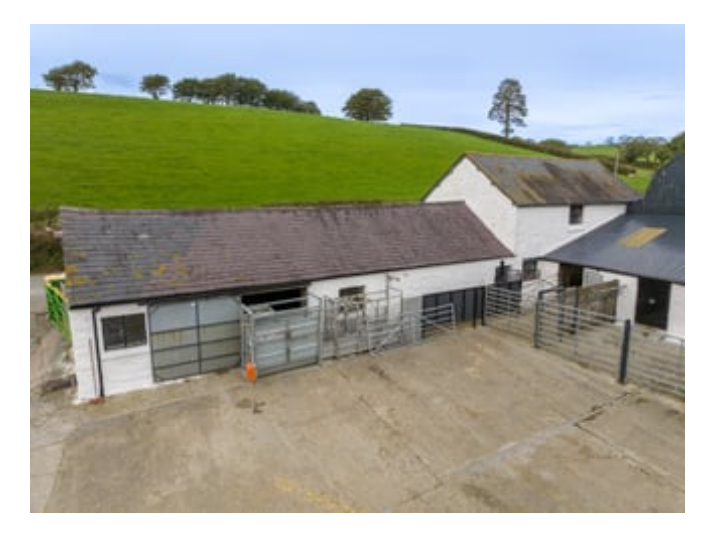
General Purpose Barn

18' 0" x 14' 0" (5.49m x 4.27m) being Cart house with loft over.