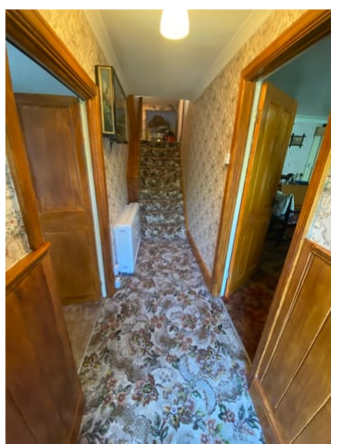
With front entry door and entrance porch with