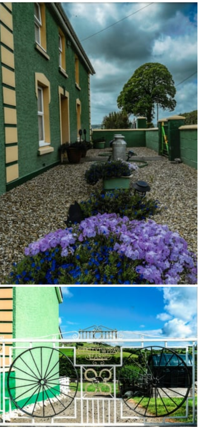
Stone and slate farmhouse with rendered elevations.

This provides more particularly as follows:-