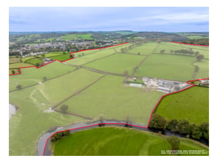
Fishery and Meadows

South of the Farm with the River Meadows