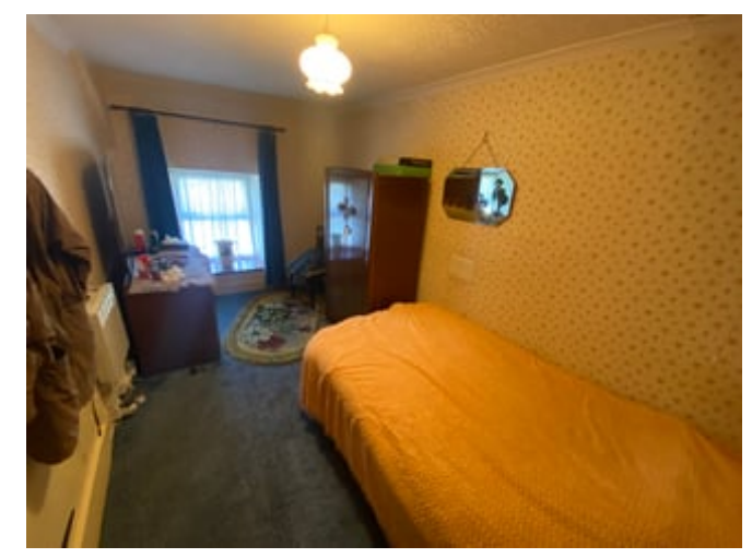
15' 0" x 7' 0" (4.57m x 2.13m) with night storage heater.