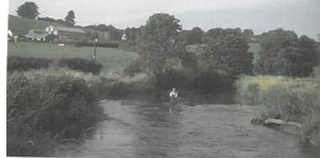
The Llettytwppa fishery, comprising some 700 yards of right-bank fishing on the Teifi a mile upstream of Pont Steffan Bridge, Lampeter.