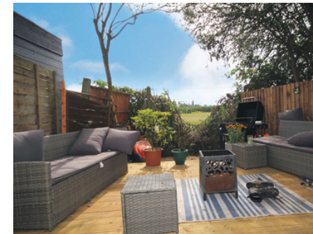
77 Ramerick Gardens, Arlesey, Bedfordshire, SG15 6XZ