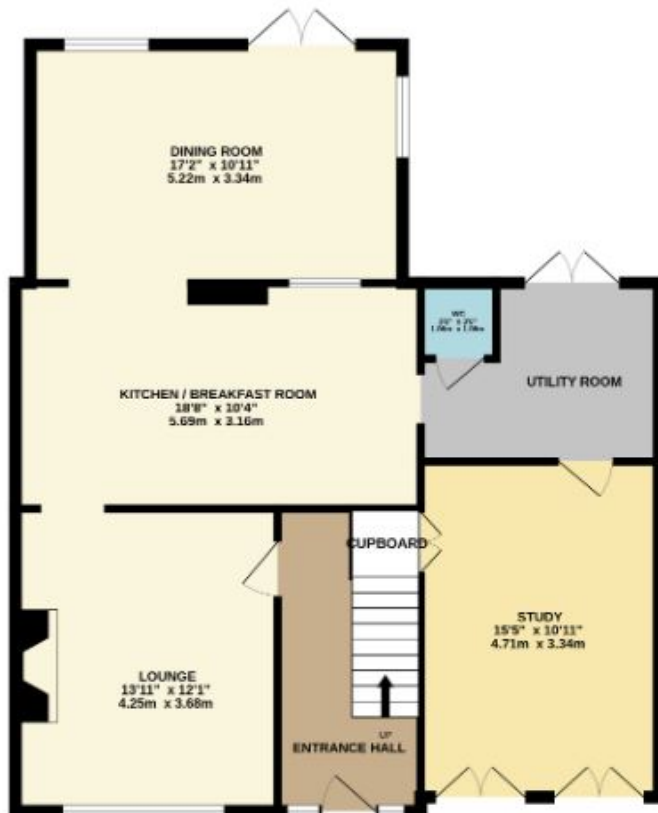
GROUND FLOOR 890 sq.ft. (82.7 sq.m.) approx.