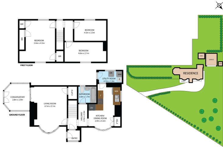
290 Toft Hill Lane, Bishop Auckland DL14 0PY, UK, DL14 0PY TOTAL APPROX. FLOOR AREA 109 SQ.M Whilst every attempt has been made to ensure the accuracy of the floor plan contained here, measurements of doors, windows, floors and any other items are approximate and do not necessarily correspond to actual dimensions, or measurements. This plan is for illustrative purposes only and should be used as such by any prospective purchaser.