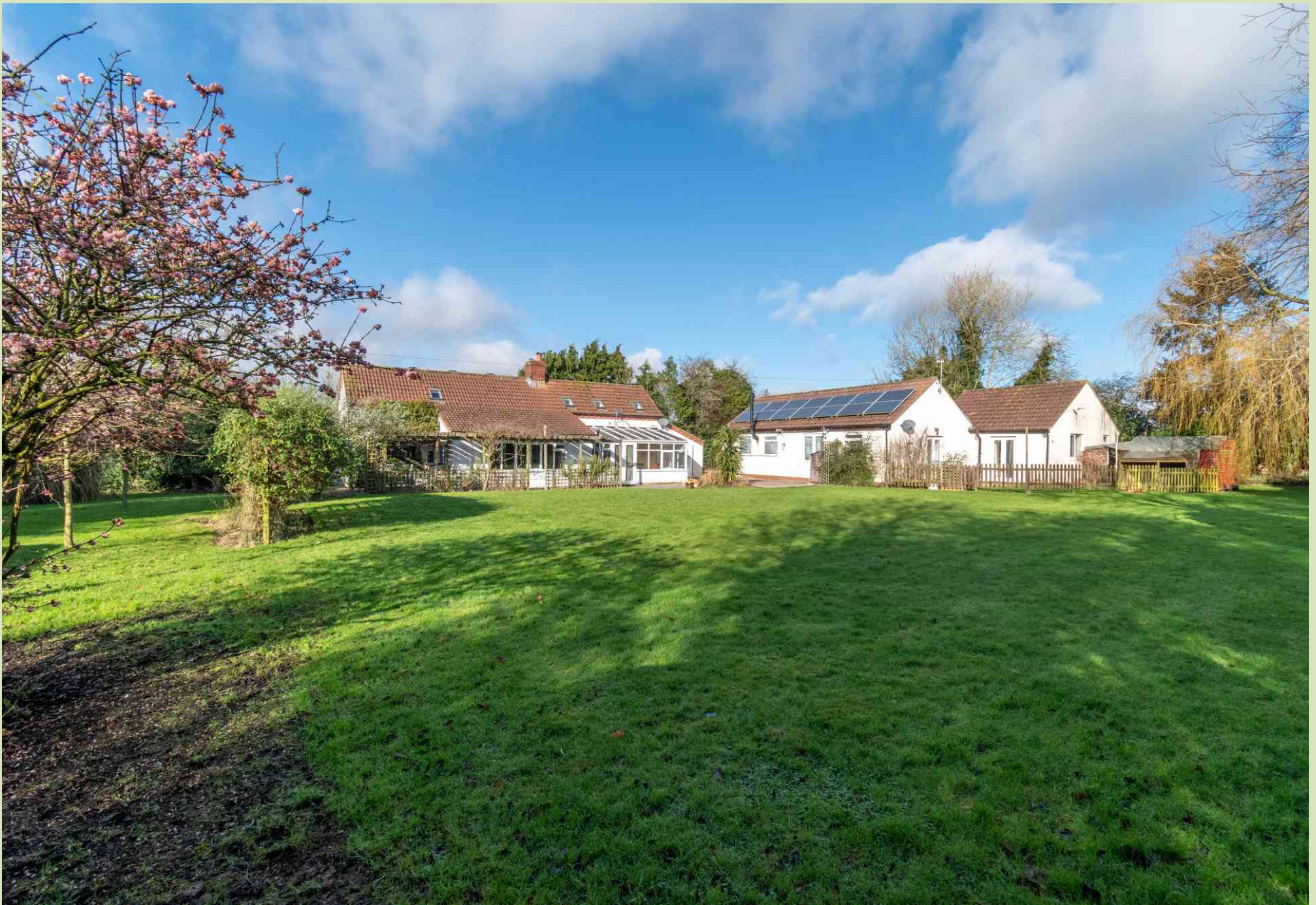
Autumn Cottage, Whissonsett Guide Price £600,000