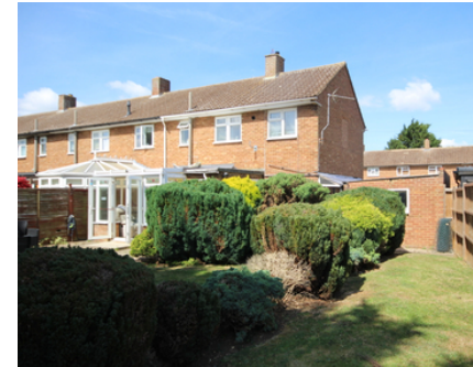
176 Western Way, Letchworth Garden City, Hertfordshire, SG6 4SS