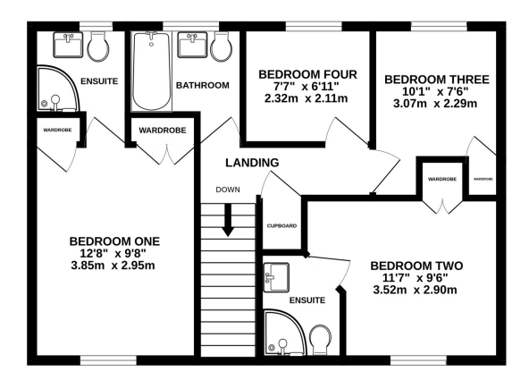
1ST FLOOR 538 sq.ft. (50.0 sq.m.) approx.