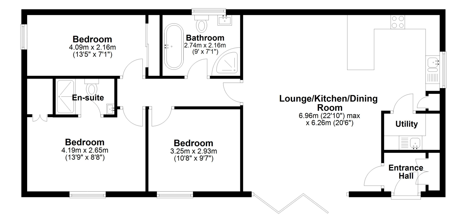
Ground Floor Approx. 90.8 sq. metres (977.2 sq. feet)