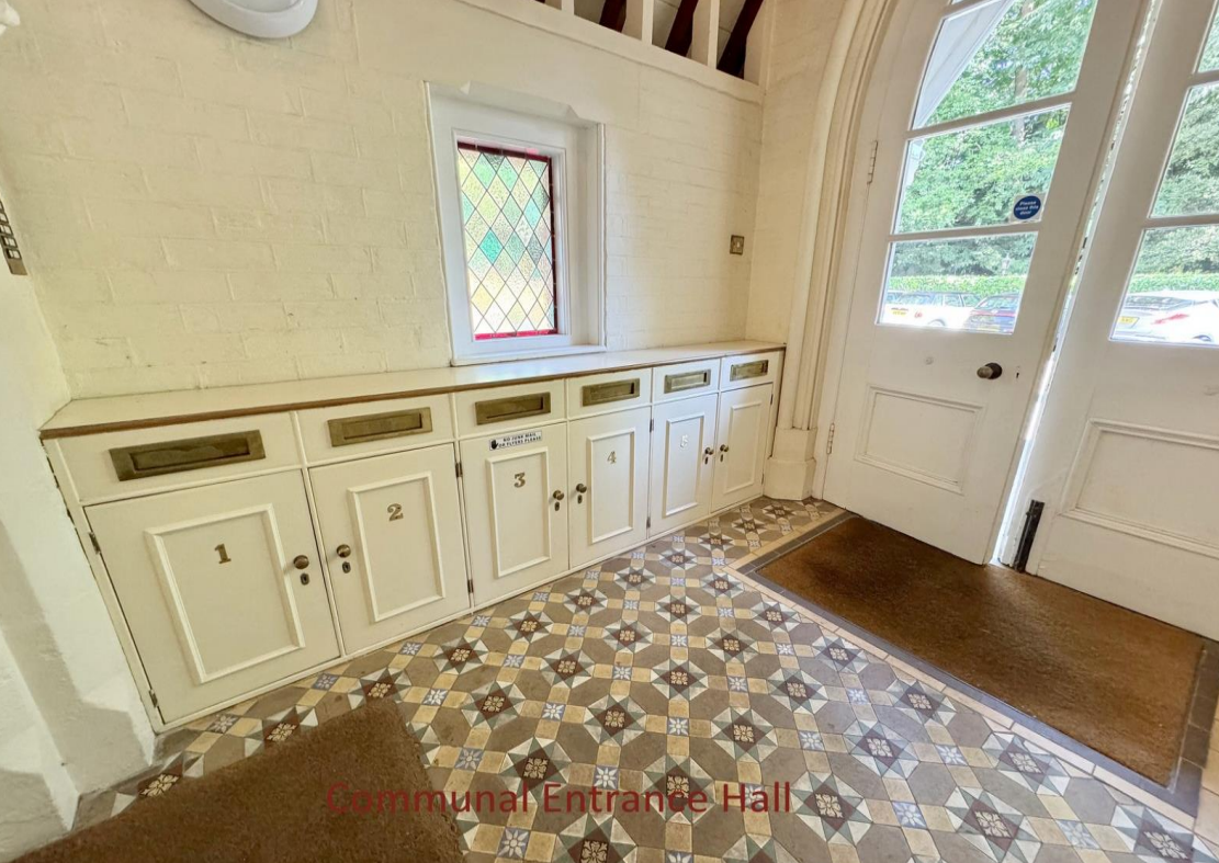
Communal Entrance Hall