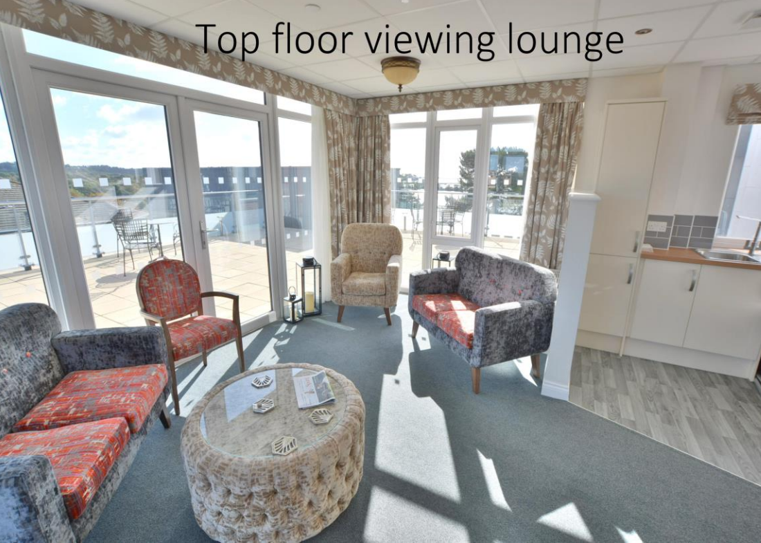
Top floor viewing lounge