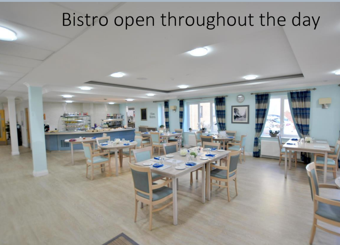
Bistro open throughout the day