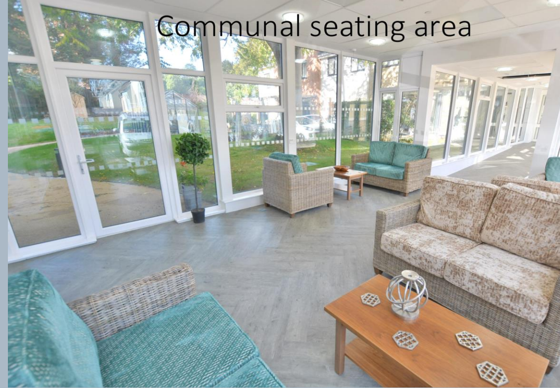
Communal seating area