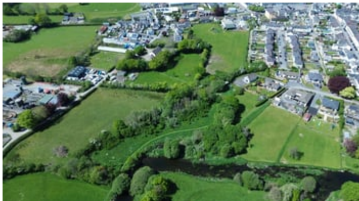
LAND (THIRD IMAGE)