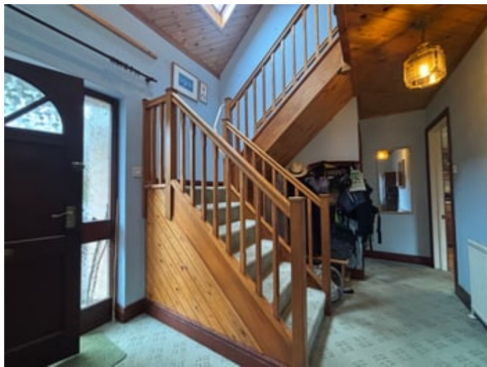
RECEPTION HALL (SECOND IMAGE)

Accessed via a recessed entrance door, staircase to the first floor accommodation with understairs storage cupboard, radiator.