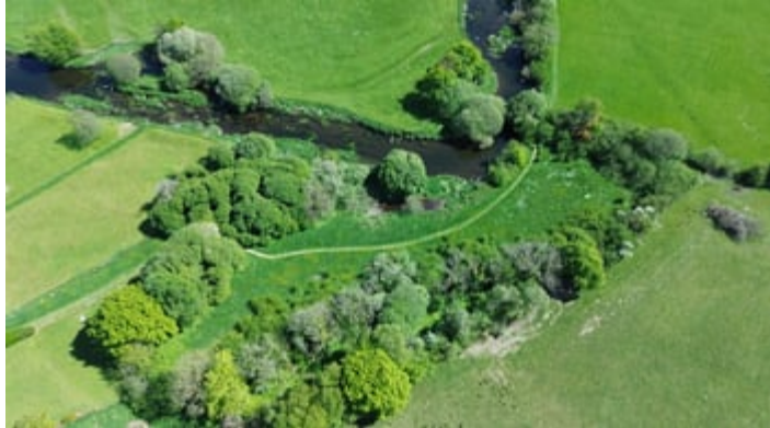
LAND (SECOND IMAGE)