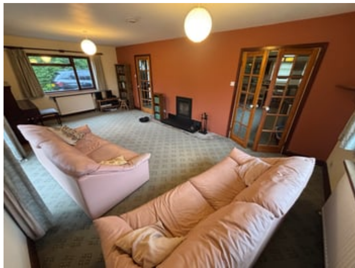
LIVING ROOM (SECOND IMAGE)

23' 3" x 12' 5" (7.09m x 3.78m). With newly fitted patio doors opening onto the rear garden area, enclosed cast iron multi fuel stove on a slate hearth, two radiators.