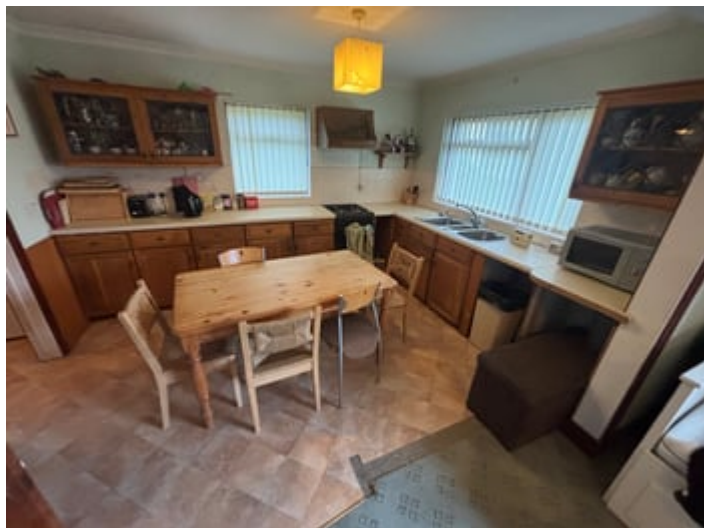
KITCHEN (SECOND IMAGE)

10' 6" x 10' 3" (3.20m x 3.12m). With a range of fitted wall and floor units with work surfaces over, 2 1/2 bowl sink and drainer unit, cooker space and point.