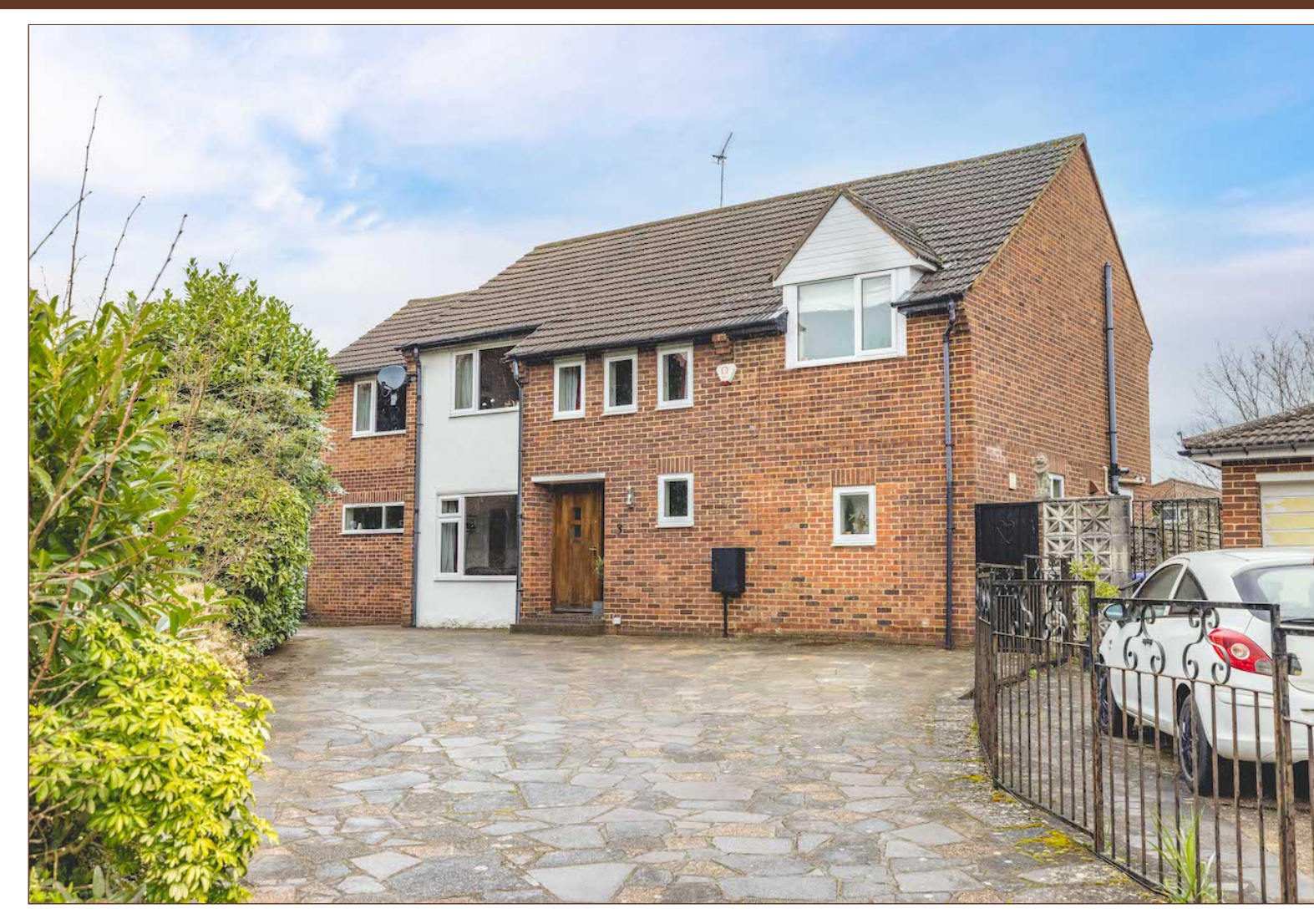
Oakwood Estates proudly offers this spacious detached property boasting 6 bedrooms, 3 bathrooms, and 3 reception rooms, nestled on a plot of approximately 0.32 Acres (1,303.00 Sq.M.). Positioned at the end of one of Iver Heath's sought-after cul-de-sacs, the property spans approximately 2185 square feet with ample room for potential extension, pending planning permission. Conveniently located near local schools, shops, pubs, and major motorways M40/M25/M4, it also enjoys a desirable school catchment area.