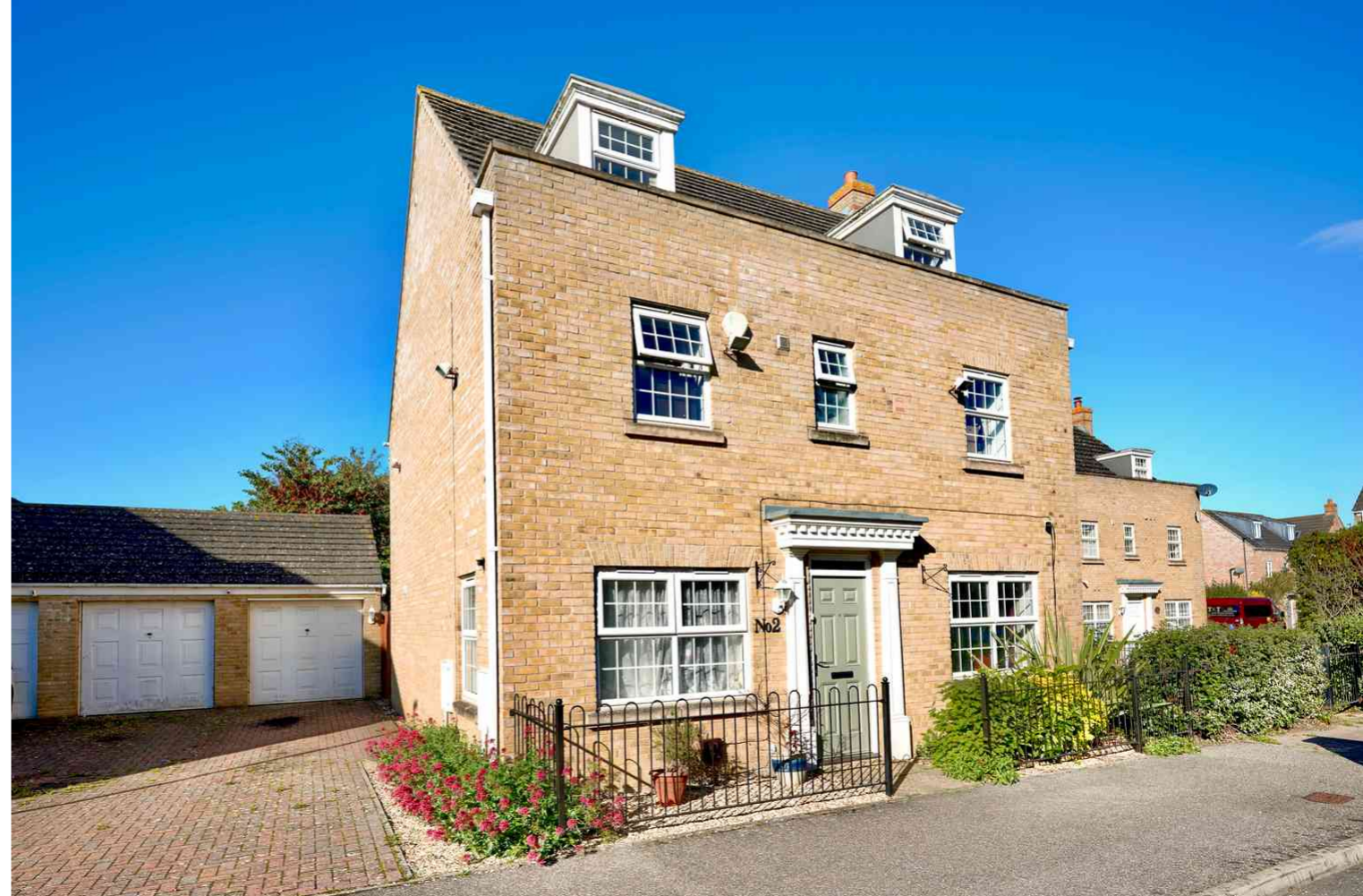
Robertson Way, Sapley PE28 2GG