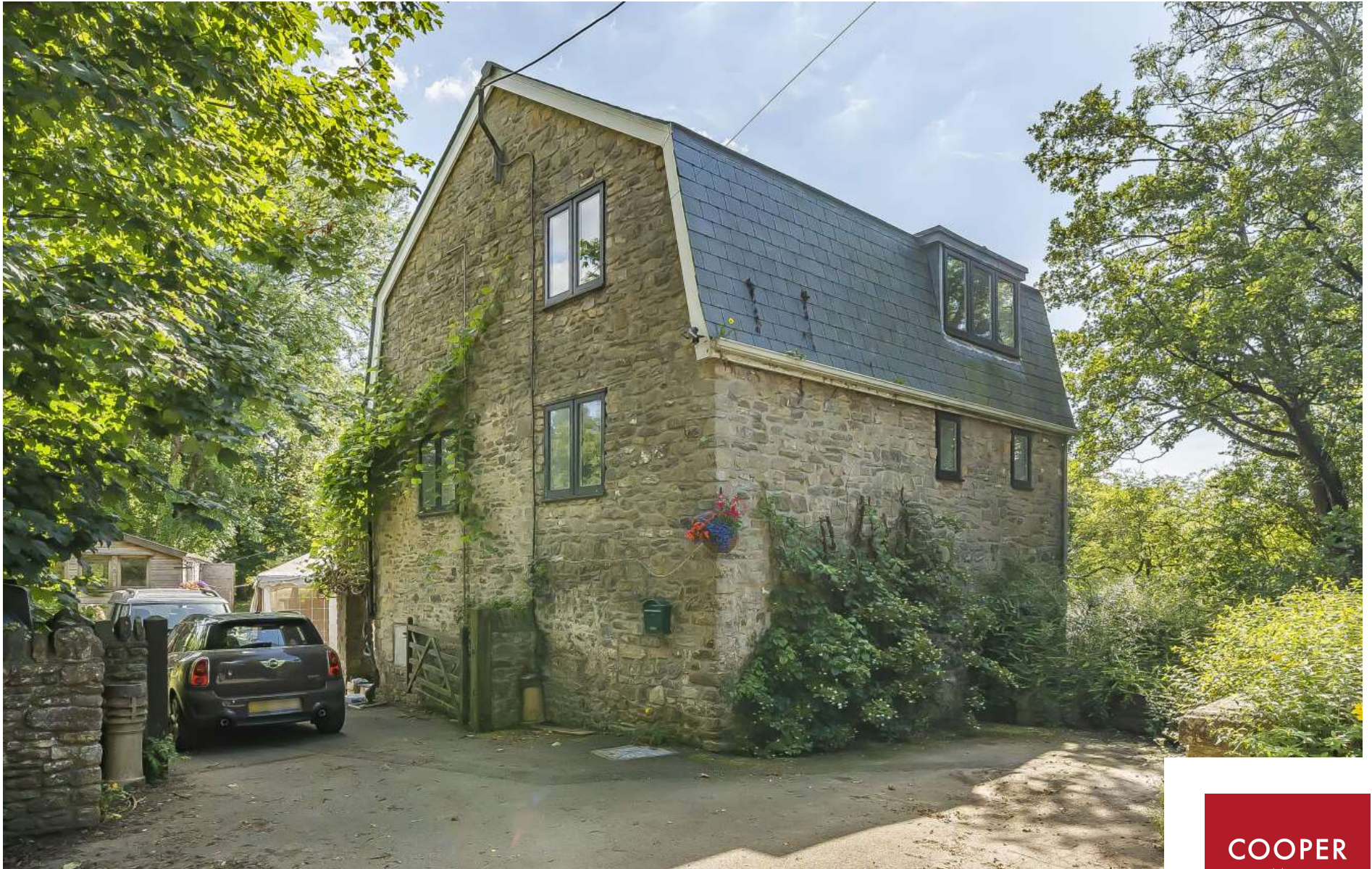
Zachary's Mill, Egford, BA11 3JP