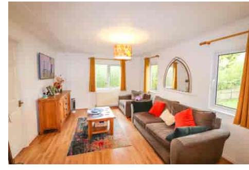
Homestead, Cottage Lane, WESTFIELD, East Sussex TN35 4RU