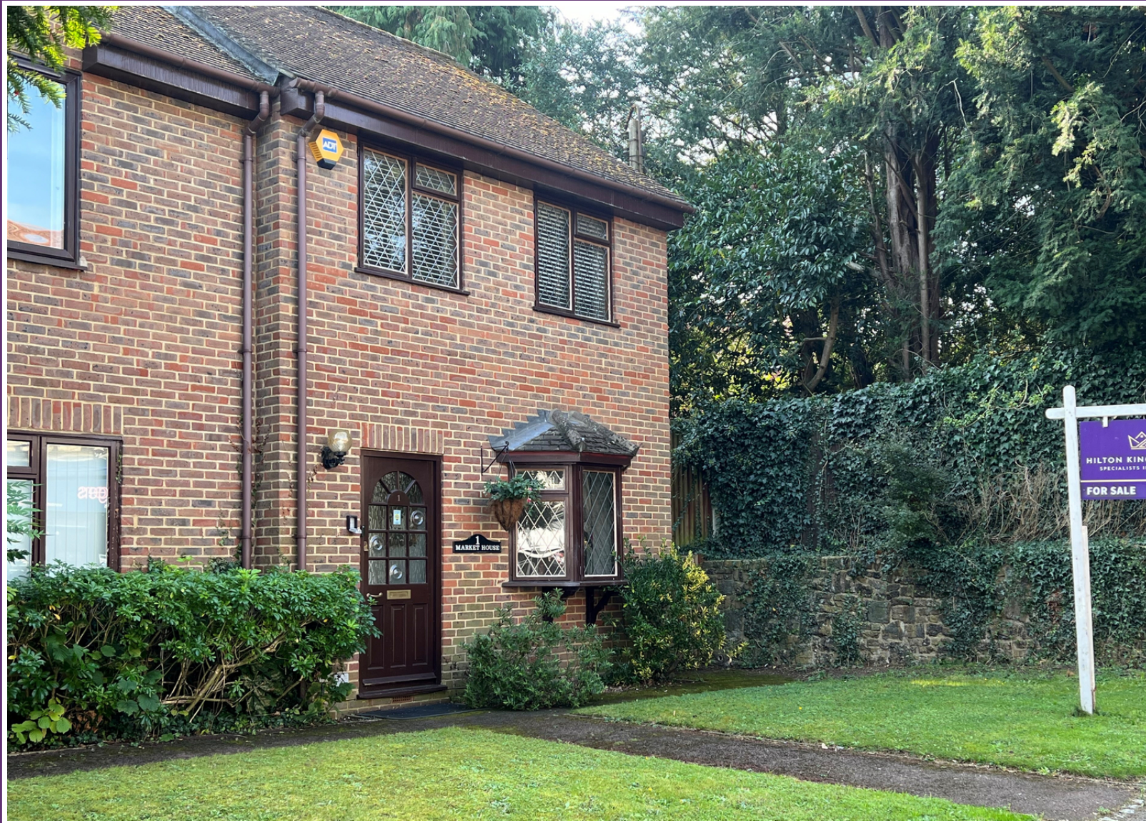
1 Market House, Market Place, Chalfont St Peter, Gerrards Cross, Buckinghamshire. SL9 9HA £335,000 Leasehold

HILTON KING & LOCKE SPECIALISTS IN PROPERTY