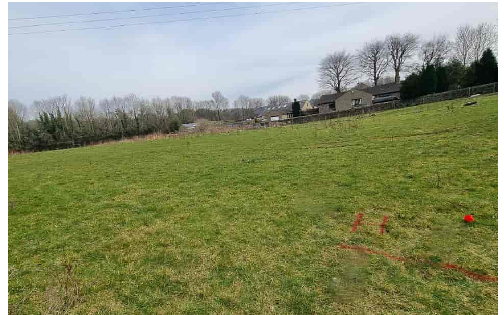
Land @, Hathersage Road, Bamford, Hope Valley, Derbyshire S33 0EB Guide Price £50,000 - Freehold