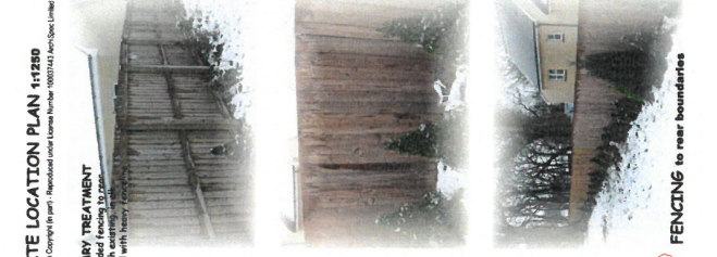
FENCING TO PLAY AREA Open vertical boarded fencing 1.1m in height with heavy broken line that to match existing fencing as shown. FENCING TO REAR BOUNDARIES 2m high stone boarded fencing to match boundaries to match existing boundaries identified with heavy broken line that to match existing fencing as shown. FENCING TO TPO BOUNDARIES Perimeter of site subject to the TPO (green line 'H') to be delineated on site by line of planting appropriate for the un-surfaced TPO area - shrubs, reedbushes or other suitable species to be agreed.

PLAY AREA 550 sq m play area identified shaded that to be prepared with heavy broken line that to match existing fencing as shown.