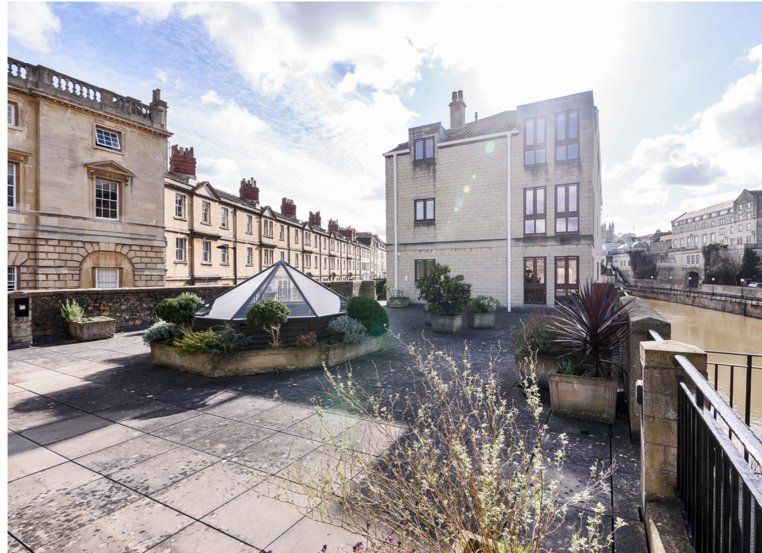
Grove Street, Bath